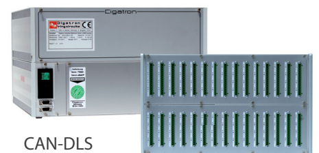
CAN-DLS Logger for additional voltage channels