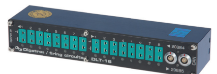
CAN-DLT Temperature Logger for 16 additional thermocouples