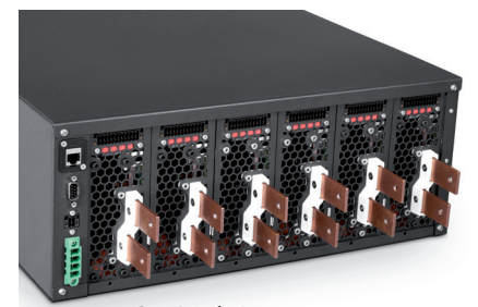
Six Pack Rear View