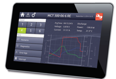
Circuit Monitoring on Portable Device (optional)