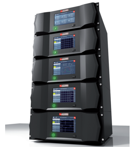
Unrivaled High Power Density